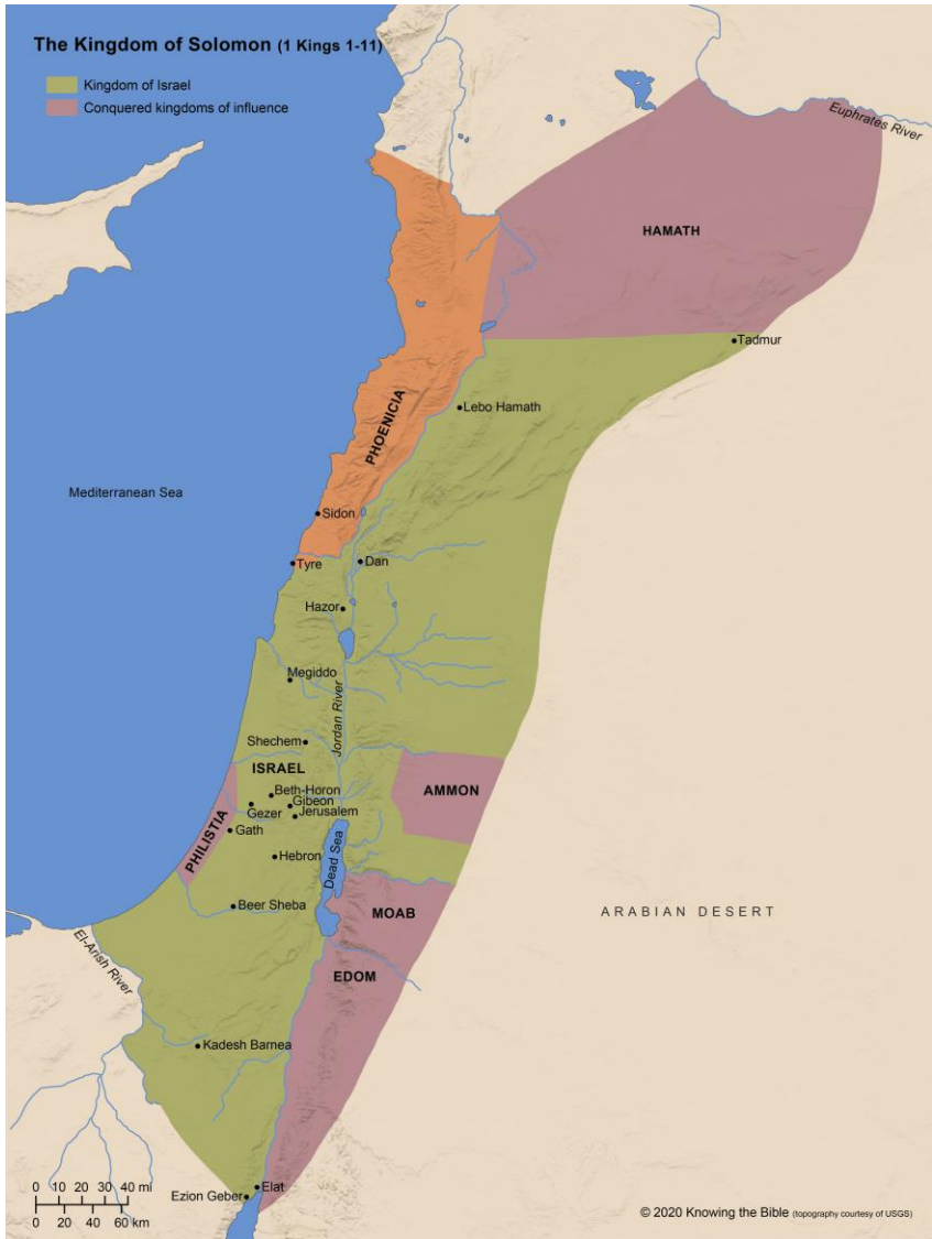
Fig. 1 The territory of Israel at the time of King Solomon