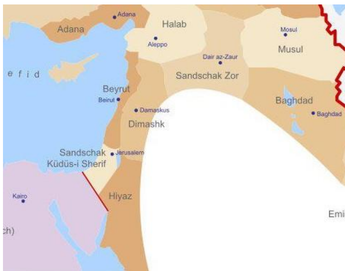
Fig. 3 The Levant in 1900

It is currently normal to speak about “Palestine” as if it should be a state within this territory, even though its leading advocates all plan the destruction of Israel. The biblical record suggests that this position is unstable, and these things will not happen.