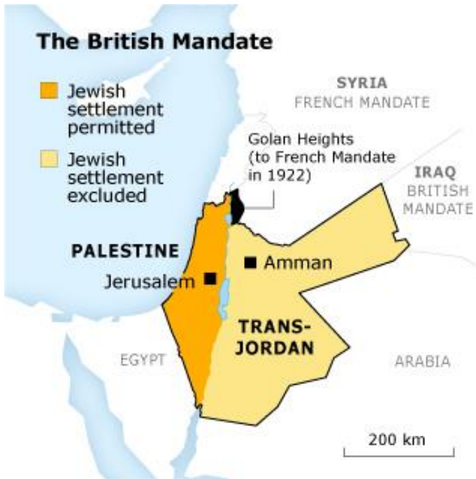
Fig. 4 British Mandate Territories 1920-1948

The Ottoman Empire fell at the end of World War 1, and its territories in the Levant were divided between the British and French Empires, as shown in Fig. 4.